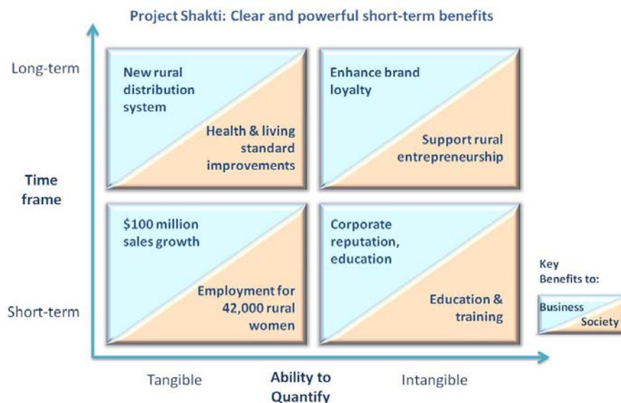
Exhibit 2 Plotting the Benefits

As you develop a clear benefits array, business case and story to communicate to all stakeholders, ask: Do we have a clear understanding of the entire benefits array and associated business case, on which we can focus, assess, and manage the potential CSR activity? Does the activity focus on fundamental value creation opportunities where we can really partner with society to realize simultaneous benefits? Are the opportunities significant, scalable, and supportive of our overall strategic priorities?